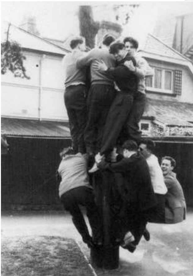
Pillar Box Record near Bournemouth Municipal College