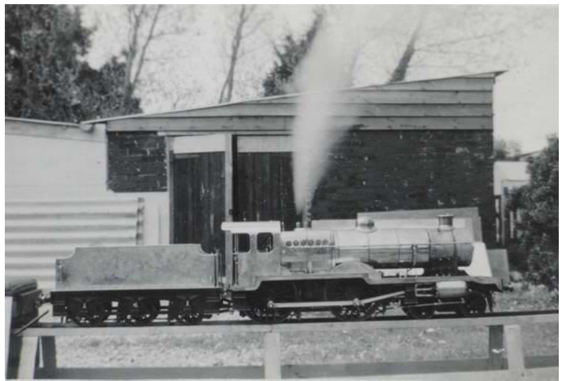
Steam Engine manufactured by apprentices