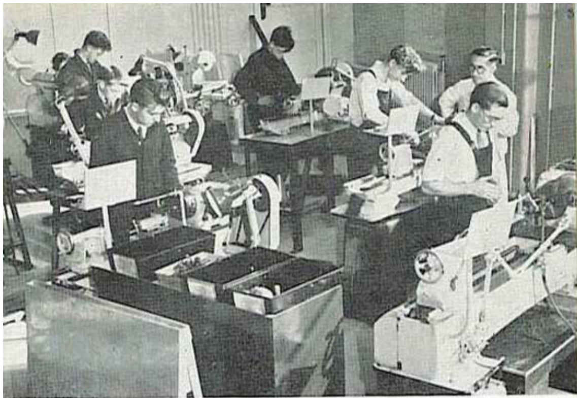
AN INTERIOR VIEW OF THE TECHNICAL SCHOOL