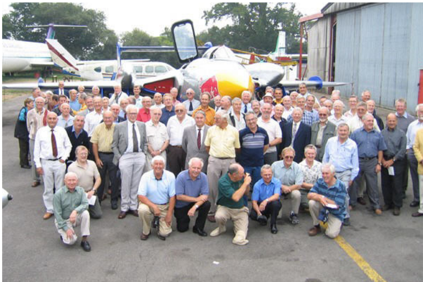
Bournemouth Aviation Museum, Hurn, 2003