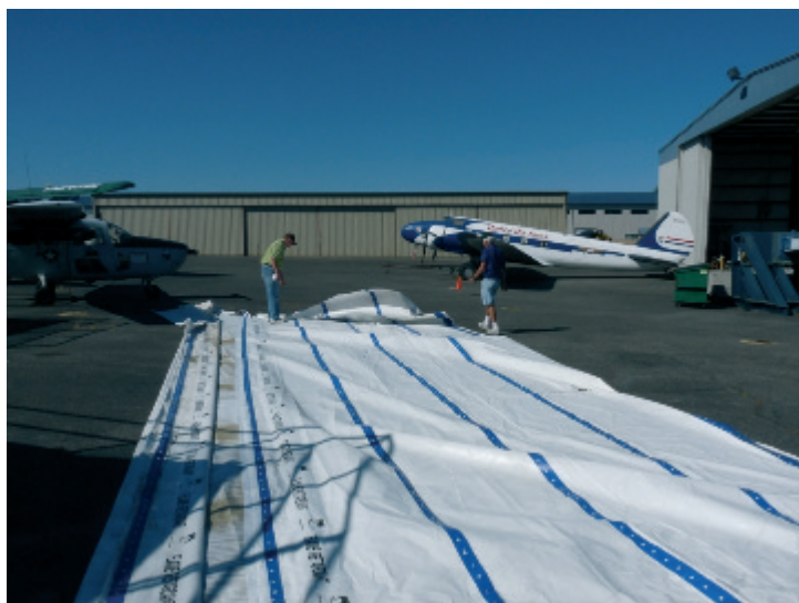
Figure 4 Assembling Wing Cover Fabric

The plastic fabric for wing top-and-bottom cover panels, and the large vertical panels forward and aft of the wings were formed by taking 12.5 foot wide strips of fire retardant plastic reinforced fabric (reclaimed from a construction site) and taping them together with special tape that claimed to form a chemical weld between adjacent sheets. (We were disappointed to later learn that these taped joints would prove to be the weak point in the concept.) A few weeks after mounting, the port wing top cover was torn due to more than 60 mph winds. Subsequently a system of through fabric battens was created to limit movement of the fabric under very high wind conditions. However, a critical look at the overall port wing result left us concerned we would not have a cover with low enough air leakage to make possible the low 35% Relative Humidity needed to stabilize wing internal corrosion.