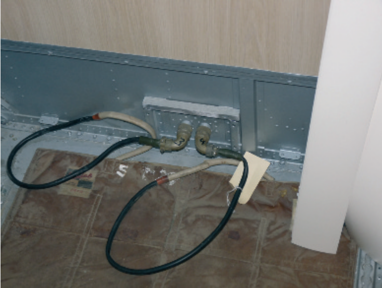
Center section under carpet floor heating “electric blanket” (important passenger comfort item, as the floor here is a pressure bulkhead and the fuel tanks below would track the -75 degree F OAT at altitude).