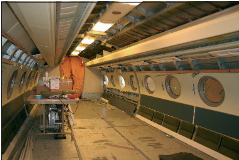
Aft passenger compartment, March 2009.

In preparation for the winter, exterior work included removing all tail surfaces, which were then moved