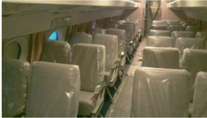
Figure 5 Aft Passenger compartment