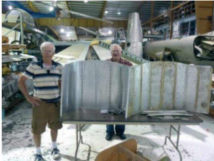
Figure 8 Aileron Control Bay – aft baggage compartment barrier --- before (right) and after (left)

Man-months of work beginning more than a decade ago are vindicated by the visually striking final result.