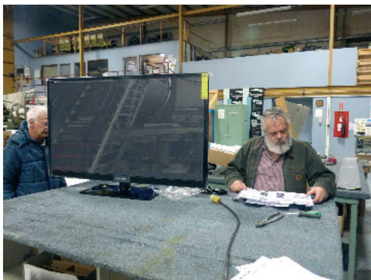
Figure 7 Setting up the new flat screen presentation display