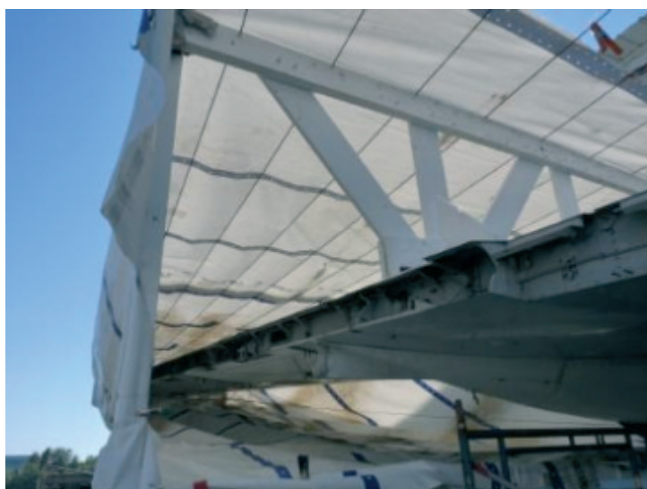
Figure 5 First Fabric Over Port Wing Tip

The plastic fabric for wing top-and-bottom cover panels, and the large vertical panels forward and aft of the wings were formed by taking 12.5 foot wide strips of fire retardant plastic reinforced fabric (reclaimed from a construction site) and taping them together with special tape that claimed to form a chemical weld between adjacent sheets. (We were disappointed to later learn that these taped joints would prove to be the weak point in the concept.) A few weeks after mounting, the port wing top cover was torn due to more than 60 mph winds. Subsequently a system of through fabric battens was created to limit movement of the fabric under very high wind conditions. However, a critical look at the overall port wing result left us concerned we would not have a cover with low enough air leakage to make possible the low 35% Relative Humidity needed to stabilize wing internal corrosion.