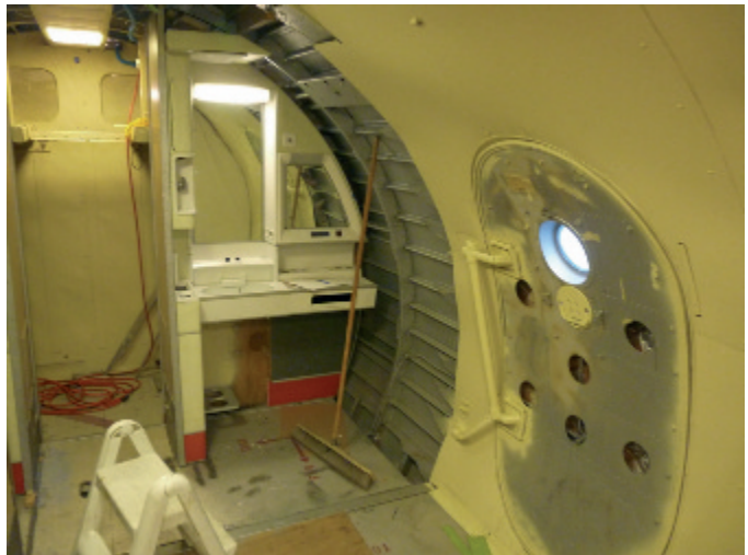
Advances in the port aft toilet and passenger door surround finish.