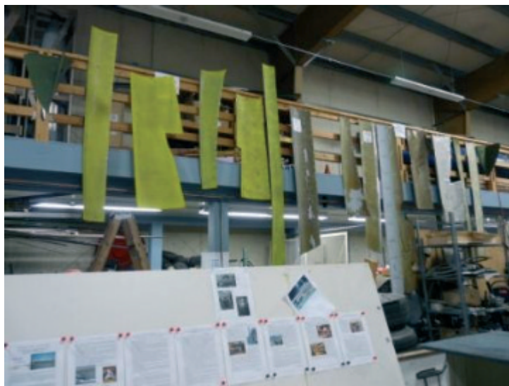
Figure 6 Wing root fairings under restoration