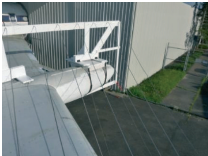
Figure 3 Wing Cover Support Cables

In the past year, we rigged a port wing cover support system, which included construction and installation of three major cable support beams roughly parallel with the main axis of the aircraft fuselage --- one 36 foot long one over the fuselage centerline, then two 26 foot beams over the pannier tanks. This included special platforms constructed to fit over the pannier tanks to support the associated beam forward ends, and the manufacture of steel locating straps to positively secure the pannier tank beam supports and the side-to-side and lengthwise position of the fuselage top beam. Wing tip panels were removed and replaced by rigid cable mounting points. A portable ladder was built to reach from either port or starboard wing root to ease access to the fuselage top beam when installing the wing cover fabric.