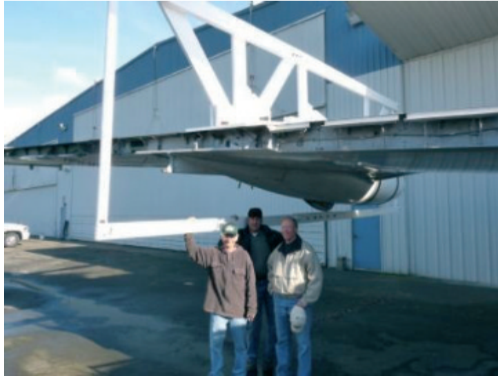
Figure 2 Pannier Tank Cable Support Beams

That is the general plan. Many time consuming and complex steps are underway to bring all of this about.