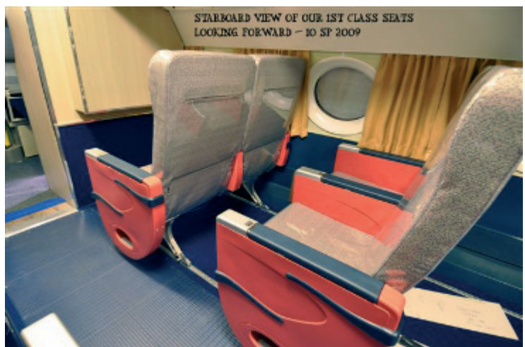
STARBOARD VIEW OF OUR 1ST CLASS SEATS LOOKING FORWARD - 10 SP 2009