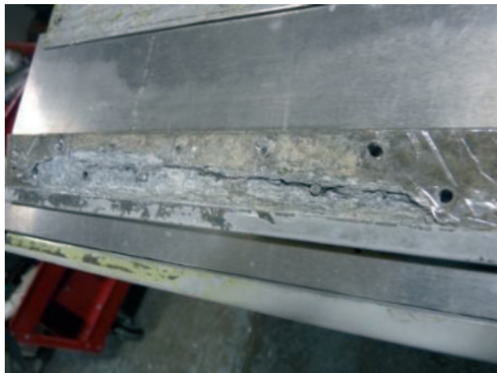
Figure 11 Port inboard flap trailing edge – before restoration