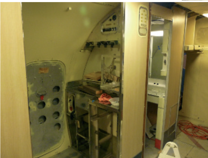
Aft starboard galley and toilet.