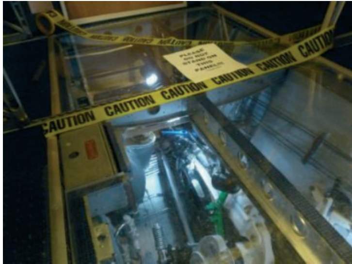
Figure 10 Aileron Control Bay viewed through its clear acrylic floor panel