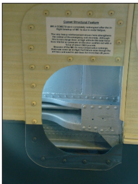
Reinforcement at corner of emergency exit.

The aft passenger cabin should also reproduce the original appearance. But, in this section, we are going to show visitors a few of the many very creative and technically impressive features of the de Havilland design. Features to be highlighted include the massive reinforcement around the emergency exit. Also, we plan to have a clear panel in the floor over the aileron control bay. Its many features will be spotlighted with explanatory placards drawing visitor's attention to the 'fly by hydraulics' controls and many levels of system redundancy. A small clear panel in the ceiling will also show the very advanced (for the 1940s) use of Coanda effect to direct air-flow from overhead ducts to the space between the outer skin insulation and the interior finish panels.