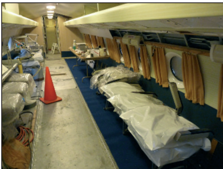
Aft cabin with trial carpet fitting, more window curtains in place. Note the grill in the center aisle floor.

So far, we have very closely recreated the appearance of our aircraft's forward half more than half a century ago when those 1959 Hatfield flights took place. The accuracy of reproduction was recently confirmed when we received a 1960 first class section photo from the Mexico City Mexicana museum. It shows an interior almost exactly like ours!