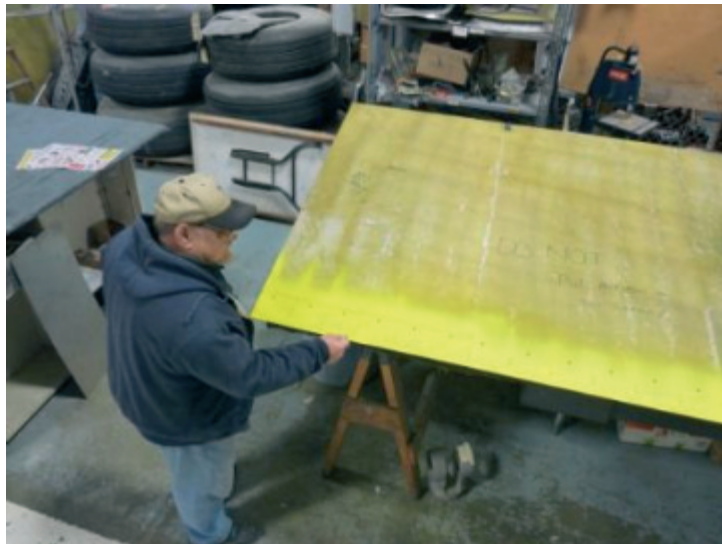
Figure13 Finished Flap Trailing Edge

This report concludes with grateful thanks for the dedication of the restoration crew --- which continued with unabated progress during the project manager's two-month recovery from injury due to a serious fall from the wing pannier tank.