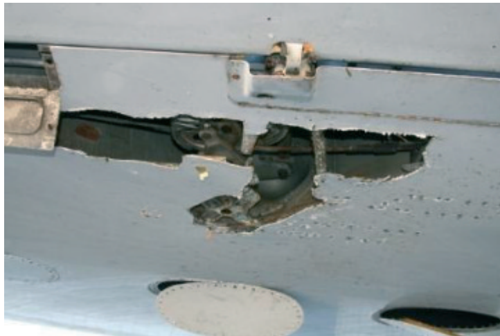
Figure 1 – Corrosion Damage to wing bottom skin

Construction of a protective wing cover system was begun in 2011 to keep the wings in a controlled dry air environment using the same Munters dehumidifier that presently protects the Comet aft fuselage and the interior of the first Boeing 727.