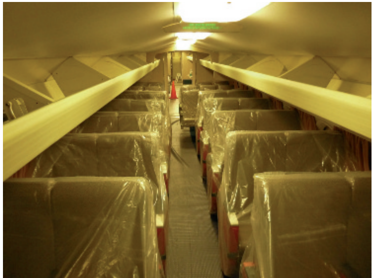
Forward cabin overview, with the new seats in place.