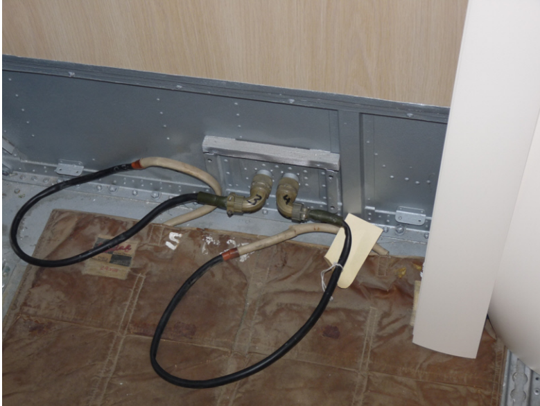
Center section under carpet floor heating "electric blanket" (important passenger comfort item, as the floor here is a pressure bulkhead and the fuel tanks below would track the -75 degree F OAT at altitude).