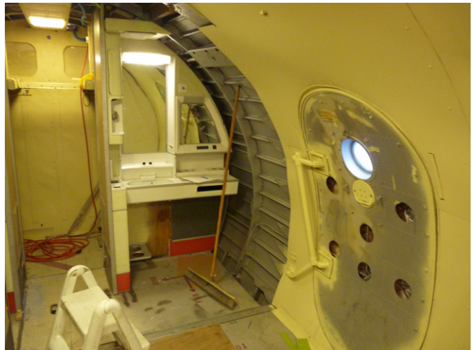
Advances in the port aft toilet and passenger door surround finish.