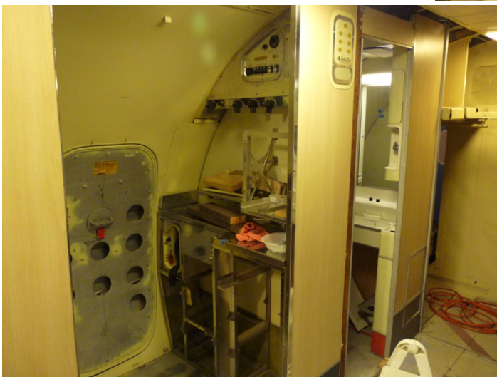
Aft starboard galley and toilet.