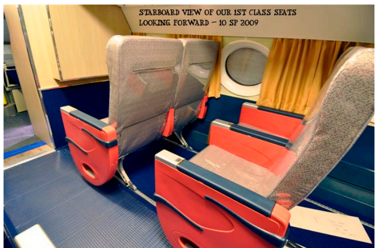
Close-up of new seats.