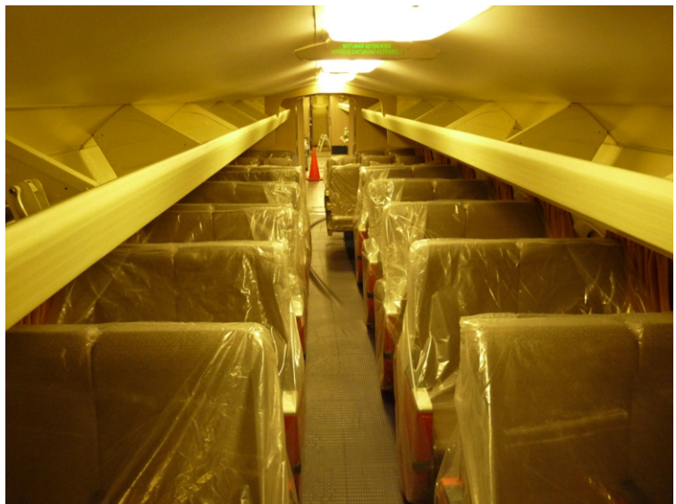
Forward cabin overview, with the new seats in place.