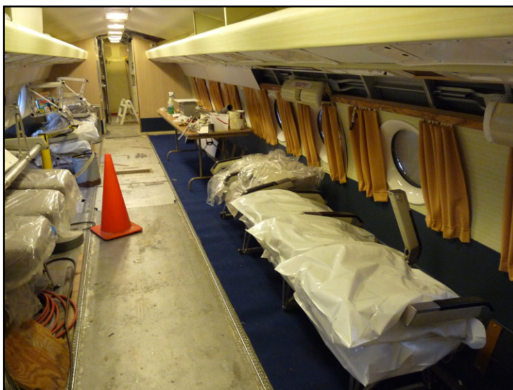
Aft cabin with trial carpet fitting, more window curtains in place. Note the grill in the center aisle floor.

So far, we have very closely recreated the appearance of our aircraft's forward half more than half a century ago when those 1959 Hatfield flights took place. The accuracy of reproduction was recently confirmed when we received a 1960 first class section photo from the Mexico City Mexicana museum. It shows an interior almost exactly like ours!