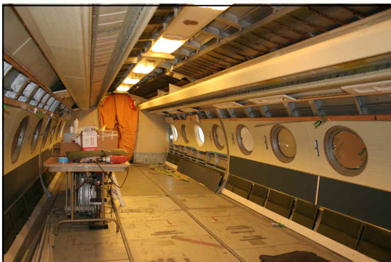
Aft passenger compartment, March 2009.

into the hangar for restoration and protection from the elements. The horizontal stabilizers are mounted on the wooden frames originally used to remove them from the aircraft. Inside the hangar work began by separating the horizontal stabilizer leading edges and removing much of the defrosting duct work. An accumulated mess left by generations of nesting birds was flushed out to begin the restoration process. The wing and fuselage surfaces to remain outside were cleaned as well as we could.