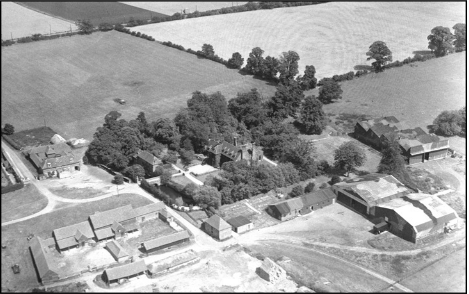
Salisbury Hall and workshops, 23rd July 1945