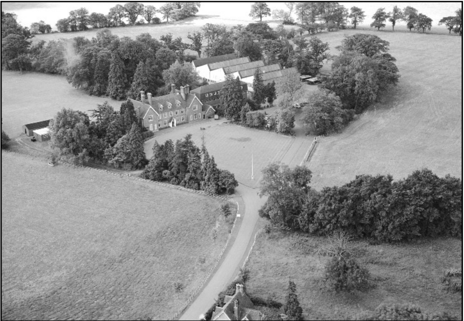
Astwick Manor, hostel and workshop, 21st August 1957