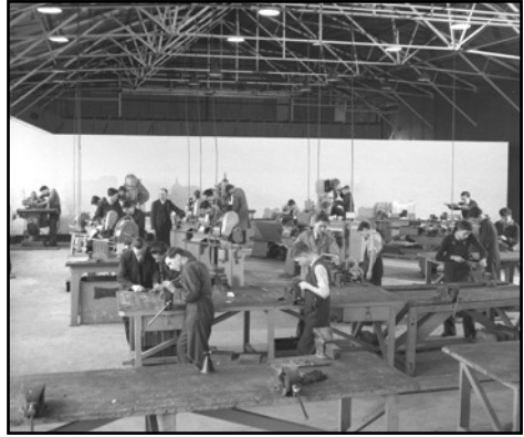
Chester workshop, January 1954