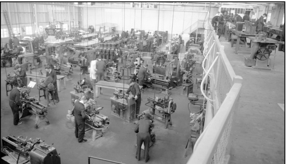
Astwick Manor workshop, December 1963. Woodwork section on balcony at right.