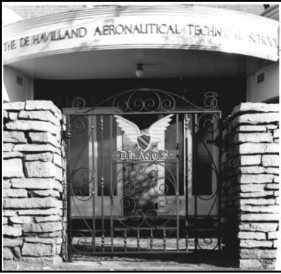
Entrance to DHAeTS Christchurch